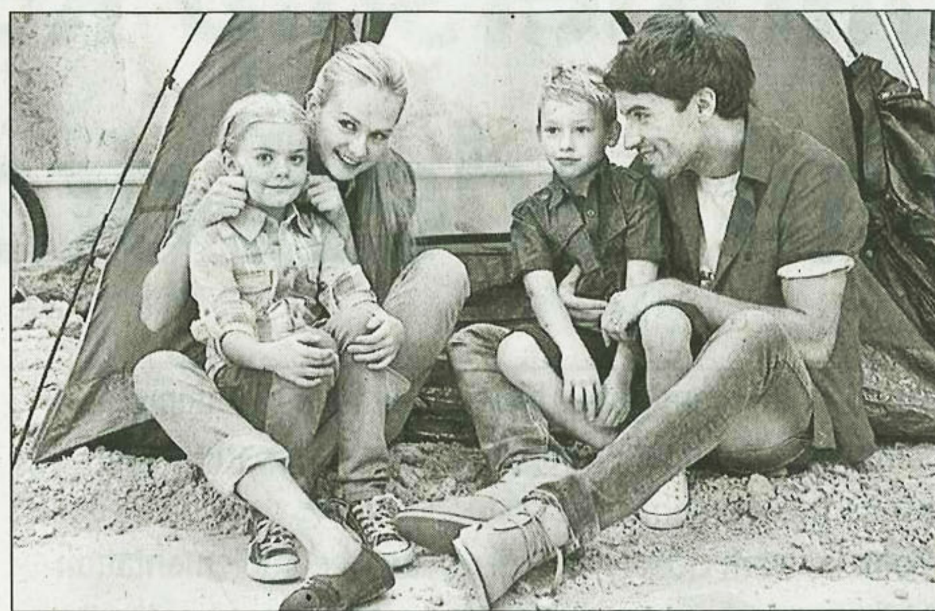
LOVE THE EARTH: Jeep. collection is designed for adventure lovers and urbanites.

This collection also features improved and refreshed jeans,