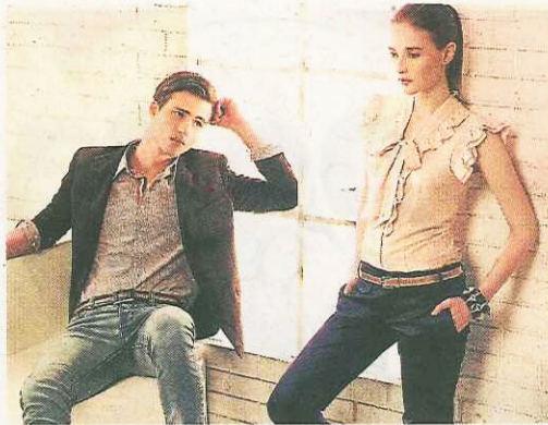
Sharp dresser: Biem's men's collection offers eye-catching shirts, classic jackets and tapered pants.

B IEM has launched a vibrant collection of work apparel with the theme "Living Colours", designed to transform the mood of this season.